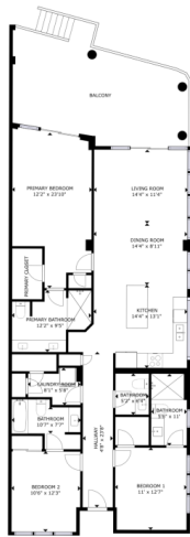
Seacrest Residences 2

GROSS INTERNAL AREA FLOOR 1: 2,283 SQ. FT. TOTAL: 2,283 SQ. FT.